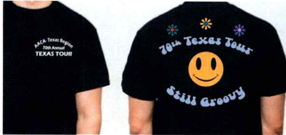
Option 1 shirt Smiley Face